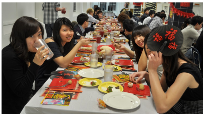
Resident Students enjoyed a formal dinner in the TMP cafeteria to celebrate the Chinese New Year.