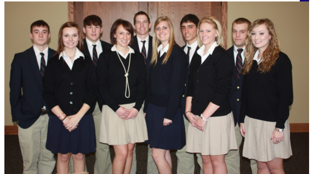
Monarchs always look their BEST! These students are in "Wednesday Dress" and are getting ready to celebrate Mass with students from Holy Family Elementary

Despite the fact that, "Never was a story of more woe Than this of Juliet and her Romeo," students have been engaged and enlightened.